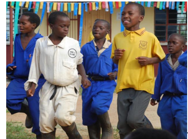
The children celebrate the opening of the Education Centre